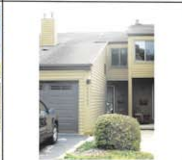
48245 Bayshore, Belleville $159,900- 2 bdrm, 1.1 bath condo on Belleville Lake! Lakefront views from all 3 levels, finished walk-out bsmt w/ bar, fireplace & balcony. Spectacular!

BE HOME FOR THE HOLIDAYS! START THE NEW YEAR IN A NEW HOME, AND WE CAN HELP!