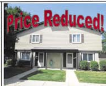
41295 Woodbury Green, Belleville $46,900- 2 bdrm, 1 1/2 bath, 2 story condo. Fresh paint, new carpet, patio w shed, swimming pool...a must see!