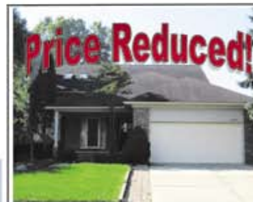
45113 Lindsey, Belleville $199,900- 3 bedroom, 3 1/2 baths, 2094 sqft, fnshd bsmt w/ theater rm, wet bar & bath, 1st flr mast ste w/ bay wndw...