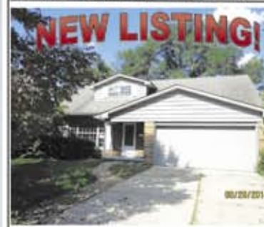
1453 Pine Valley, Ann Arbor $249,900- 4 bedroom, 2 1/2 baths, 2045 sqft home w/partially finished basement, fenced backyard, new carpet & paint!