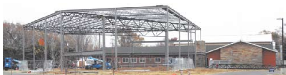
On Nov. 13 this is how Bethany Bible Church's new construction looked, with the structure raised for the new 13,800-square-foot worship area, offices, and classrooms being built to the north of the present 14,000 square foot building at 810 East Huron River Dr.