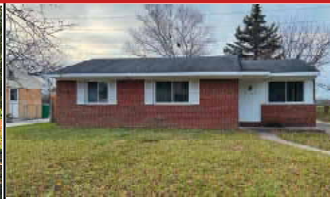
11012 JACKSON, VAN BUREN TOWNSHIP FOR LEASE IMMEDIATE OCCUPANCY Super Clean, freshly painted with new flooring throughout. 3 Bedrooms, 1 Bath Ranch. Two car garage. No Smoking or Pets $1,600 mo