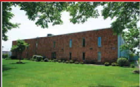
12950 HAGGERTY VAN BUREN TOWNSHIP FOR LEASE Zoned M-2 for many uses. Best location with 16,800 SqFt For Lease. 20 Foot Ceilings, Large Offices Huge Work Area. Close to I-94 & I-275. $6,900. Mo Triple Net