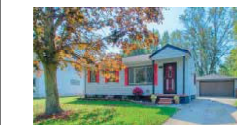
46083 REED, SUMPTER TOWNSHIP Amazingly Affordable 3 Bedroom One Bath Ranch with New Carpet, Large Patio, Big Garage with New Roof, Fenced Yard, City Water and Sewer on Paved Street. A Best Buy $239,900