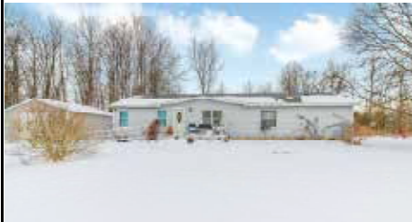
48620 WEAR, SUMPTER TOWNSHIP BEAUTY WORTH CELEBRATING 3 Bedrooms, 2 Baths (One New) 1,690 Sq Ft on 1.3 Acres. Deck and Large Pole Barn room for a workshop and more. Extra Clean $325,000