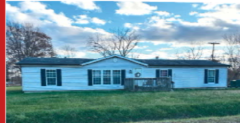
29515 CHARLES, ROMULUS COMING SOON. It's Loaded with 4 Bedrooms, 2 1/2 Baths, 1,647 Square Feet, Fireplace, Deck and More. On 1/2 Acre with Huge Garage. 1996 Construction Just $200,000