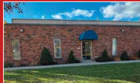
12900 HAGGERTY VAN BUREN TOWNSHIP FOR LEASE - UPDATED OFFICE SPACE Best Area on Paved Street. 510 Sq Ft With One Large office and Second office. It's clean and Neat $1,250 Mo

WE DON'T CHARGE WHAT THE OTHER BROKERS CHARGE - NO DOCUMENT STORAGE FEES NO COMPLIANCE FEES NO JUNK FEES