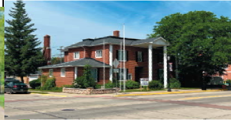
209 MAIN STREET, BELLEVILLE IT'S A POSSIBLE ANYTHING! 7,000+ Square Foot Building on High Traffic Main Street. Large Rooms Everywhere Finished Basement 6 plus Car Attached Garage. $749,000

84 ACRES OAKVILLE WALTZ ASH TOWNSHIP-MONROE COUNTY. 1268 FRONTAGE ZONED LIGHT INDUSTRIAL AND RESIDENTIAL. NEAR I-275 Great Investment $795,000