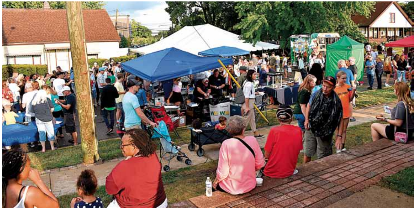
The Taste of Belleville was one of the biggest ever – after the rain stopped on Thursday, Aug. 18.

Friends of Michigan Animals Rescue 51299 Arkona Road Belleville, MI 48111 734-461-9458 phone 734-461-9459 fax www.friendsofmichigan.org